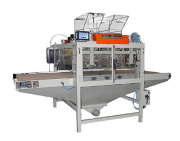
Flocking machine mod.TT2