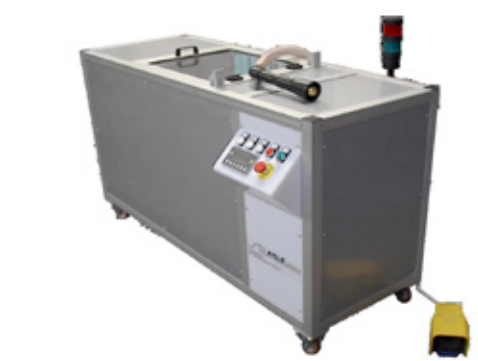
Electropneumatic flock distributor mod. ESP1

Production department equipped with modern tool machines and high profile carpentry.