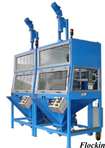
Flocking machine mod.FR1/R