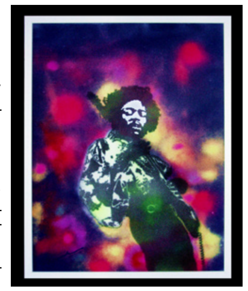
Jimi Hendrix III / 50cm x 70cm

You experience a complete new style of textile Art. The structure of the fibres brings out a picturesque, concentrated impression of colours. Daylight makes the colour swing, the tones mixing smoothly. Floating structures draw you into the space. Hidden motives open your mind. A display to inspire touching and dreaming.