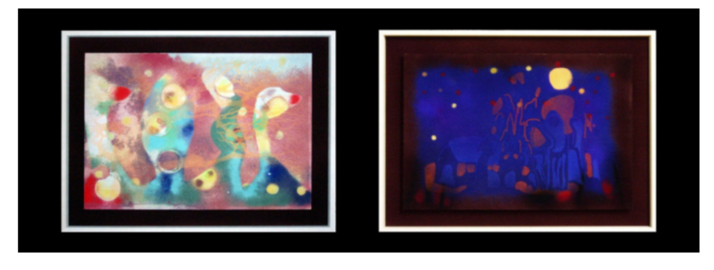
Neues Leben / Nacht ii